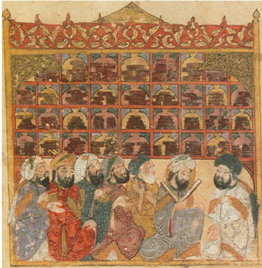
Islamic Library Manuscript, 13th Century CE

1. Describe the appearance of the men in this mural.