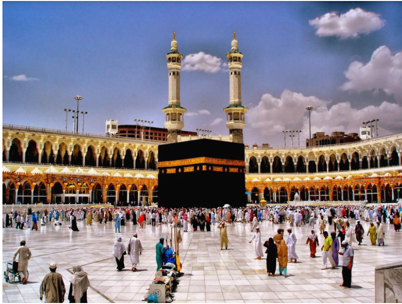
The Kaaba in Mecca

1. Why is the holy city of Mecca popular?